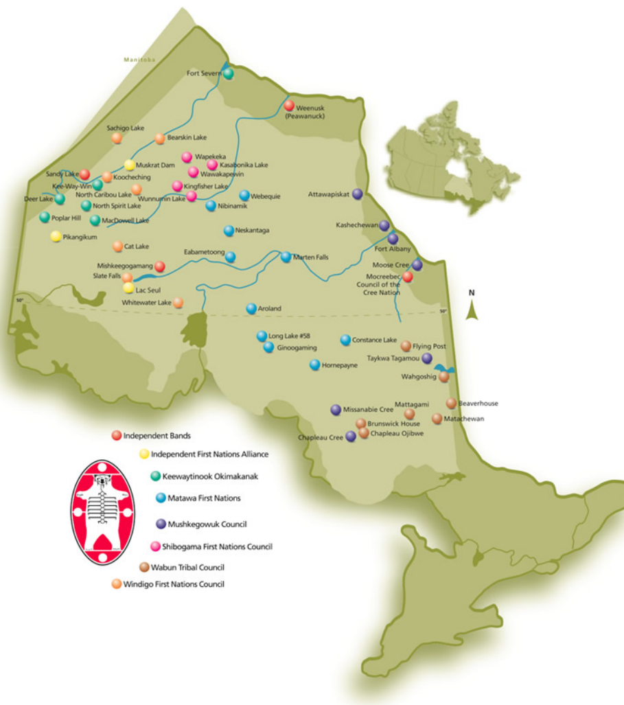
Figure 1. Map of First Nation Communities in Northern Ontario (Nishnawbe Aski Nation, 2012).